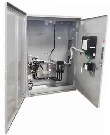
ASCO SERIES 300 SE Rated 200 amperes in Type 3R enclosure

ASCO SERIES 300SE products use two types of construction.