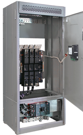
ASCO SERIES 300 SE Rated 800 amperes Type 1 enclosure